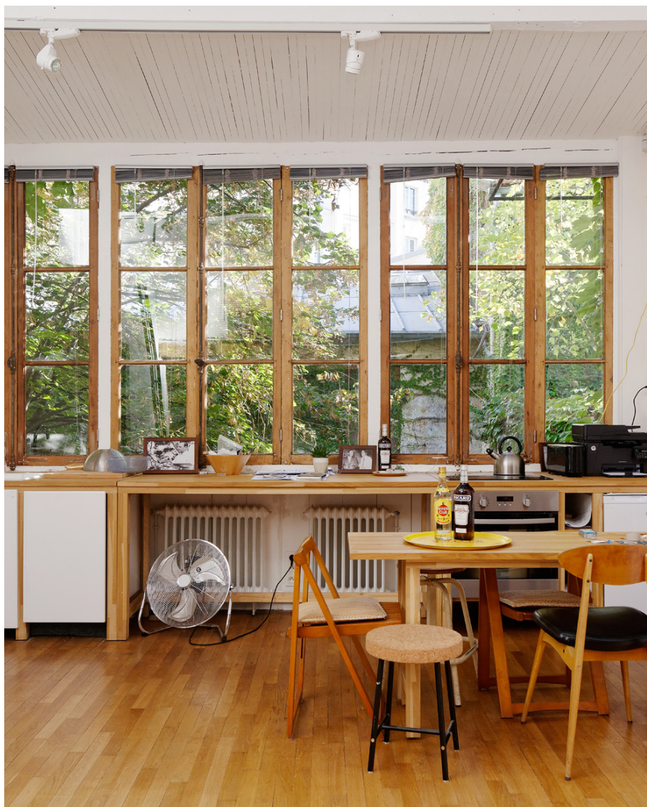
View of the Studio Pernod Ricard at Villa Vassilieff – Pernod Ricard Fellowship, 2016